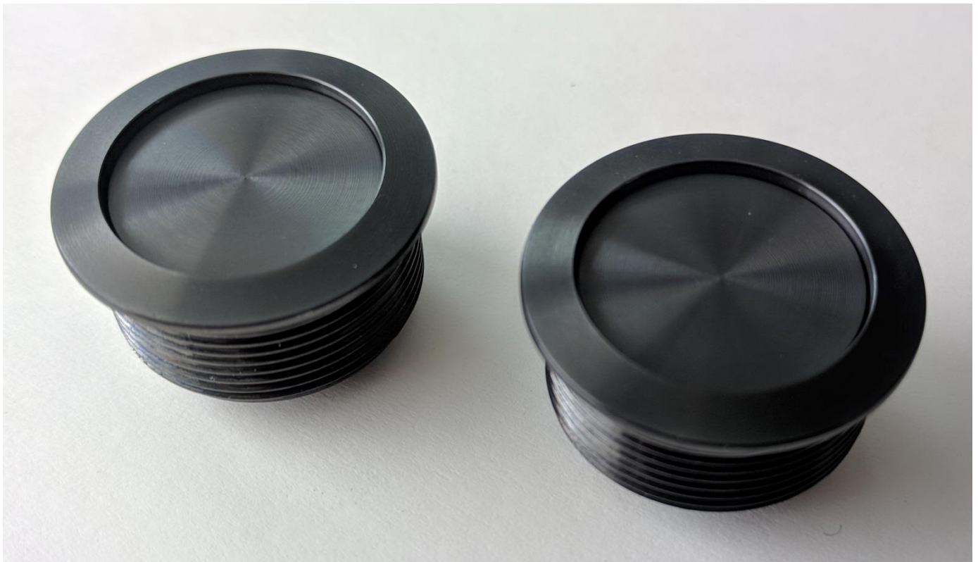
Note: These samples are not MCS19, but show the same surface colour appearance as MCS19 would.

Appearance Stainless Steel with black PVD treatment: