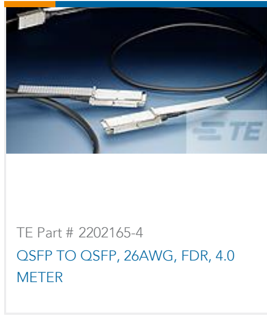
TE Part # 2202165-4 QSFP TO QSFP, 26AWG, FDR, 4.0 METER