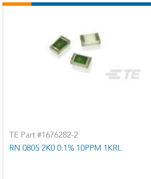
TE Part #1676282-2 RN 0805 2K0 0.1% 10PPM 1KRL