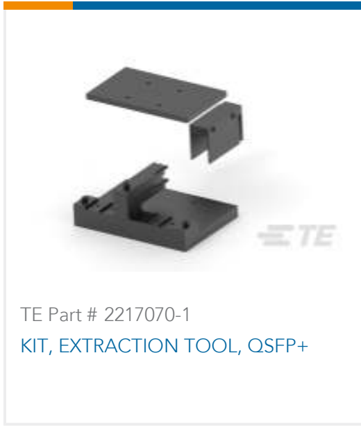
TE Part # 2217070-1 KIT, EXTRACTION TOOL, QSFP+