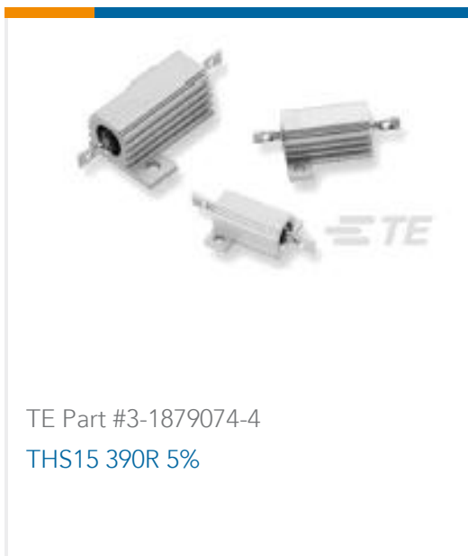
TE Part #3-1879074-4 THS15 390R 5%