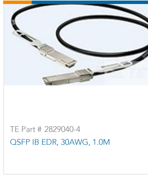
TE Part # 2829040-4 QSFP IB EDR, 30AWG, 1.0M