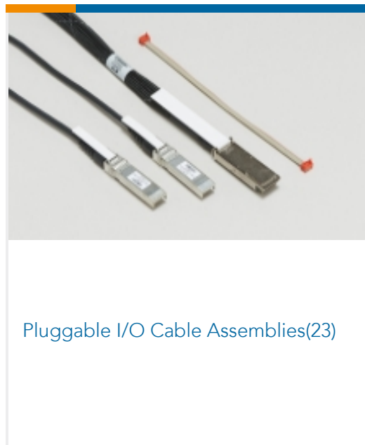
Pluggable I/O Cable Assemblies(23)