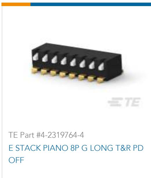
TE Part #4-2319764-4 E STACK PIANO 8P G LONG T&R PD OFF