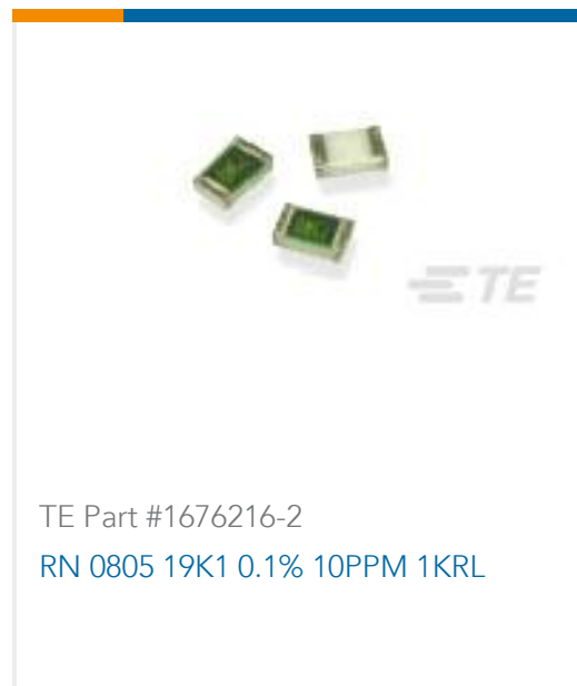
TE Part #1676216-2 RN 0805 19K1 0.1% 10PPM 1KRL