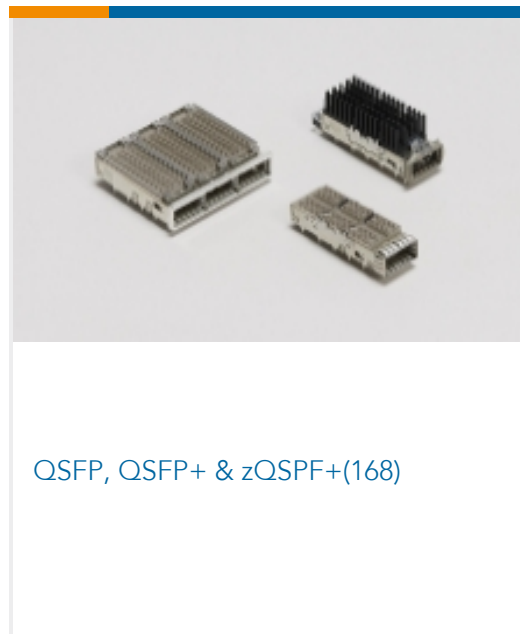
QSFP, QSFP+ & zQSFP+(168)