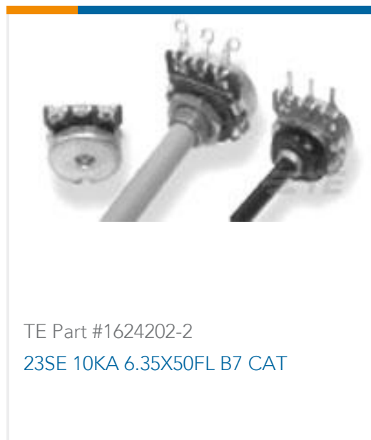
TE Part #1624202-2 23SE 10KA 6.35X50FL B7 CAT