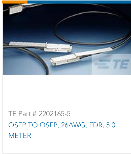
TE Part # 2202165-5 QSFP TO QSFP, 26AWG, FDR, 5.0 METER