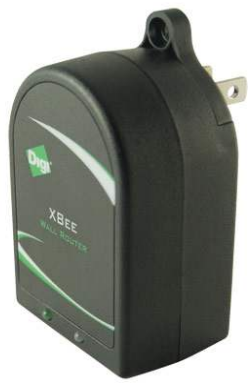
Smart Energy Range Extender