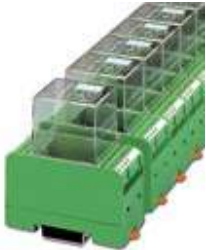
Relay module, with plug-in base for KAMMRELAIS® size 2, contact: F 104, 2 PDT

Please be informed that the data shown in this PDF Document is generated from our Online Catalog. Please find the complete data in the user's documentation. Our General Terms of Use for Downloads are valid ( http://phoenixcontact.com/download )