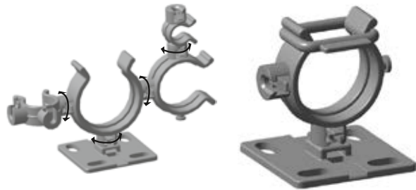
Multiple clips can be joined. Clips swivel freely.