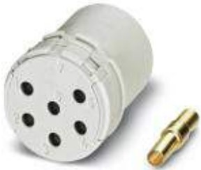
Contact insert, Number of positions: 6, Type of contact: Socket, Crimp connection

Please be informed that the data shown in this PDF Document is generated from our Online Catalog. Please find the complete data in the user's documentation. Our General Terms of Use for Downloads are valid ( http://phoenixcontact.com/download )