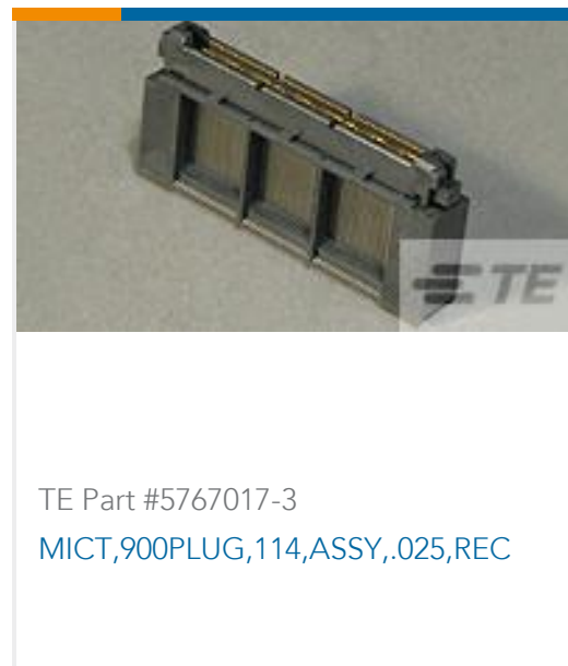
TE Part #5767017-3 MICT,900PLUG,114,ASSY,.025,REC