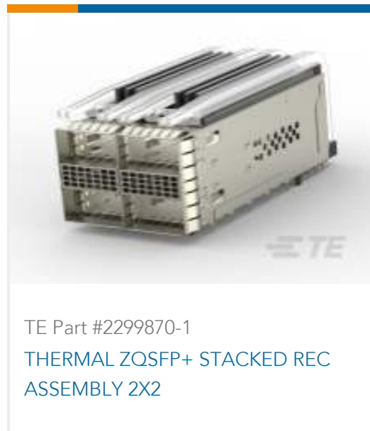
TE Part #2299870-1 THERMAL ZOSFP+ STACKED REC ASSEMBLY 2X2