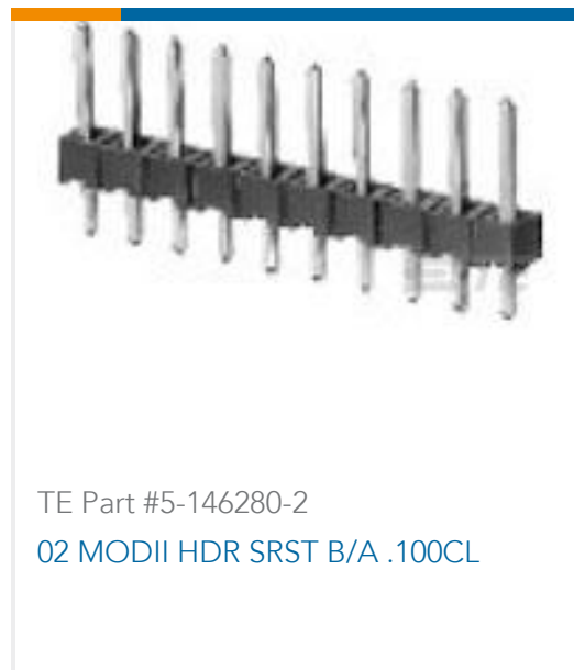
TE Part #5-146280-2 02 MODII HDR SRST B/A .100CL