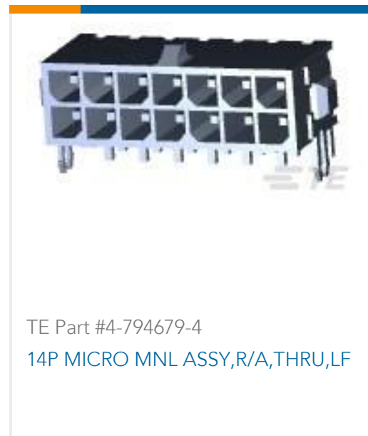
TE Part #4-794679-4 14P MICRO MNL ASSY,R/A,THRU,LF