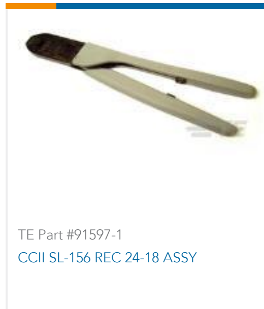
TE Part #91597-1 CCII SL-156 REC 24-18 ASSY