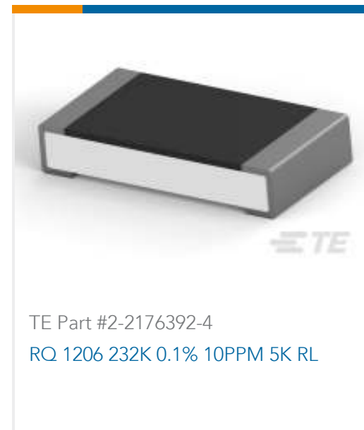
TE Part #2-2176392-4 RQ 1206 232K 0.1% 10PPM 5K RL