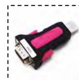
RS232 TO USB