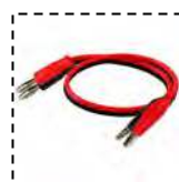
Test Leads (optional)