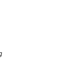
TYTEA Flux Remover, like any cleaner, cal area to determine plastics