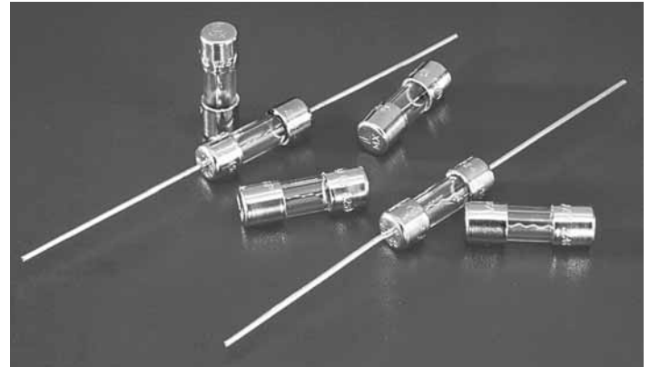
225 000 Series

Contact Littelfuse concerning other ampere ratings.