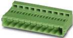
The illustration shows a 15-position version

Plug component, Nominal current: 12 A, Rated voltage (III/2): 320 V, Number of positions: 7, Pitch: 5.08 mm, Connection method: Crimp connection, Color: green, Corresponding male crimp contacts with current [A] and conductor cross section range [mm 2 ] data: 10A/ICC-MT 0,5-1,0 (3190577); 10A/ICC-MT 0,5-1,0 BA (3190603); 12A/ICC-MT 1,5-2,5 (3190580); 12A/ICC-MT 1,5-2,5 BA (3190593). BA = Bandkontakte