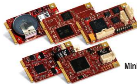
Mini PCIe Modules