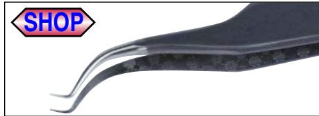
Curved Extra Fine, 3mm Long Angled Tip