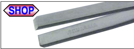
Heavy Duty Forming Tweezers