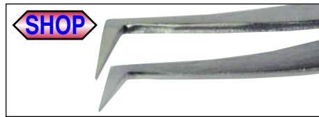
Fine Hooked & Tapered Tips