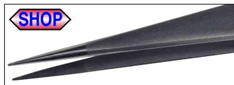
Strong Tweezers Tapered To Point