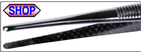
Blunt Tip Serrated