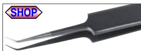
Extra Fine Points Bent 30° 3mm Long Tip