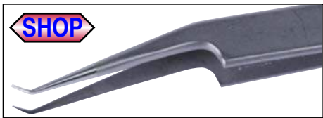
Fine Points Angled with 40° - Tip Bend