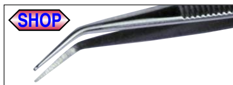
Bent Fine Tip & Serrated