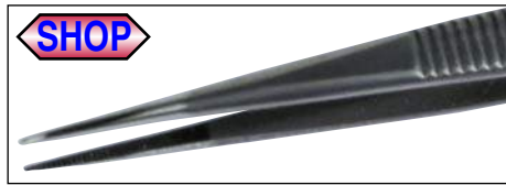
Tapered to Fine Tip Serrated