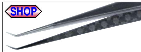
Narrow Body Low Force Bent 35° - 3mm Long Tip