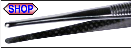
Blunt Tip, Serrated