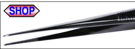
Long Tapered to Fine Tip Serrated