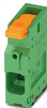
The figure shows a 1-pos. version of the product

PCB terminal block, Lever Push-in connection