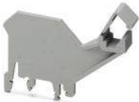
Support bracket, Number of positions: 1, Width: 2 mm, Color: gray

Please be informed that the data shown in this PDF Document is generated from our Online Catalog. Please find the complete data in the user's documentation. Our General Terms of Use for Downloads are valid ( http://phoenixcontact.com/download )