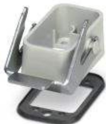
Panel mounting base with single locking engagement nose, straight design

Please be informed that the data shown in this PDF Document is generated from our Online Catalog. Please find the complete data in the user's documentation. Our General Terms of Use for Downloads are valid ( http://download.phoenixcontact.com )