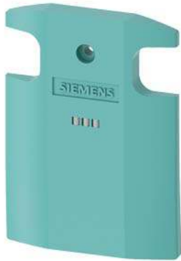
LED cover for position switch Metal 3SE51 2 LEDs, yellow/green, 110-230 V AC Color turquoise