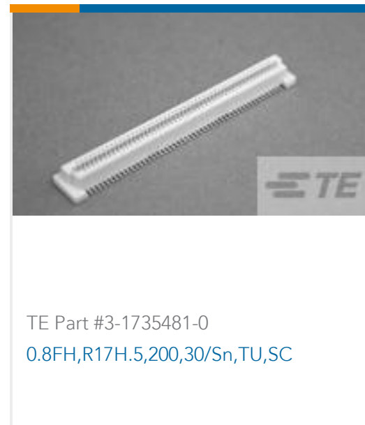
TE Part #3-1735481-0 0.8FH,R17H.5,200,30/Sn,TU,SC