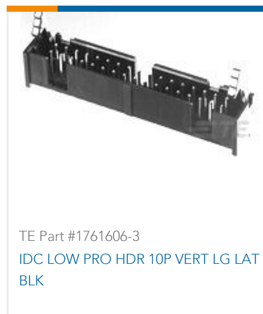
TE Part #1761606-3 IDC LOW PRO HDR 10P VERT LG LAT BLK