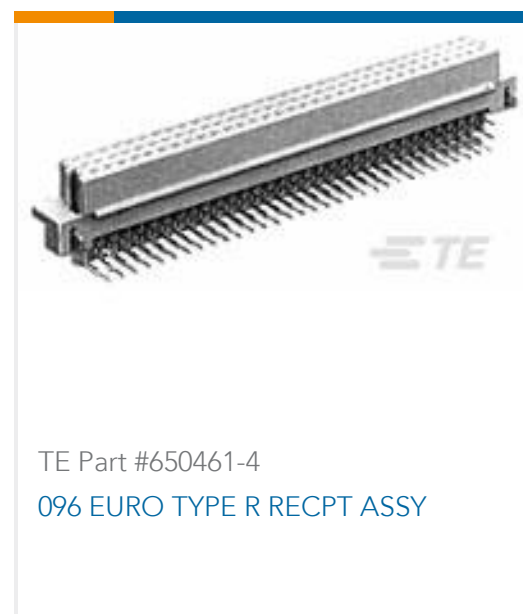
TE Part #650461-4 096 EURO TYPE R RECPT ASSY