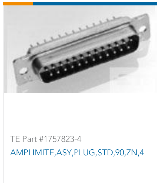
TE Part #1757823-4 AMPLIMITE,ASY,PLUG,STD,90,ZN,4