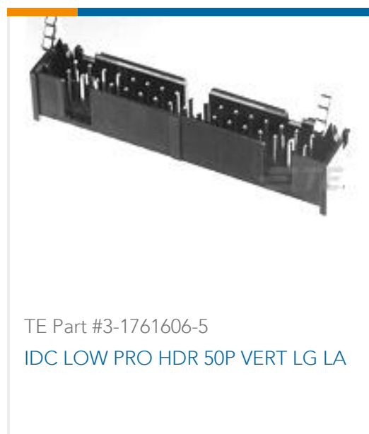
TE Part #3-1761606-5 IDC LOW PRO HDR 50P VERT LG LA