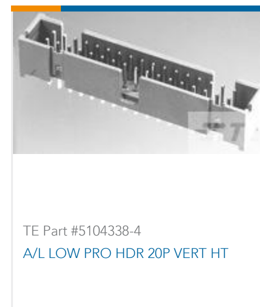
TE Part #5104338-4 A/L LOW PRO HDR 20P VERT HT