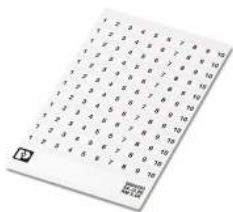
Marker card, can be ordered: by card, white, labeled according to customer specifications, mounting type: adhesive, for terminal block width: 4.15 mm, lettering field size: continuous x 3.8 mm

https://www.phoenixcontact.com/us/products/0825990