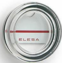
ELESAs Original design

Chamfer hole 1x45° and grease slightly the outside surface of the O-ring to make assembly easier.