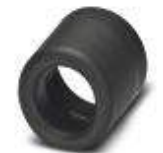
End sleeves as cable protection

Cable protection end sleeve - WP-SC PA HF 42,5 BK - 3240987