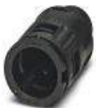
Cable gland, metric thread, IP66 protection, straight

Screw connection - WP-G HF IP66 M40 BK - 3240901