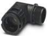
Cable gland, metric thread, IP68/69k protection, angled

Screw connection - WP-GA HF IP69K M40 BK - 3240915