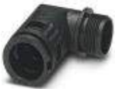
Cable gland, metric thread, IP66 protection, angled

Screw connection - WP-GA HF IP66 M40 BK - 3240929