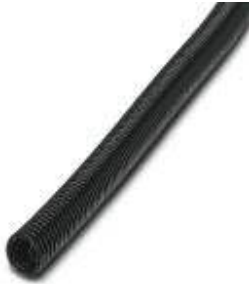
Polyamide protective hose, inflammability class HB, UV resistant

Please be informed that the data shown in this PDF Document is generated from our Online Catalog. Please find the complete data in the user's documentation. Our General Terms of Use for Downloads are valid ( http://phoenixcontact.com/download )