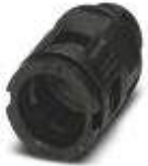
Cable gland, metric thread, IP68/69k protection, straight

Screw connection - WP-G HF IP69K M40 BK - 3240887