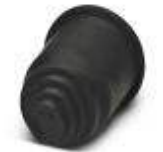
End sleeves, transition sleeves, from hose to cable

Transition sleeve from hose to cable - WP-EC TPE HF 42,5 BK - 3240980