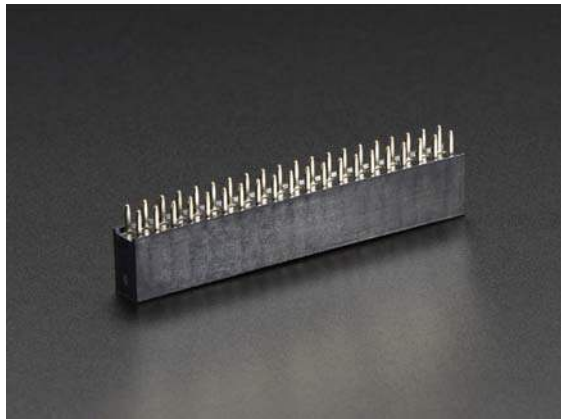
Female SKU: PIS-0243