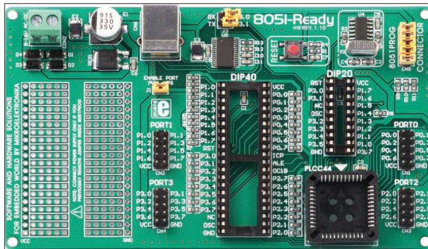
Figure 1: 8051-Ready additional board