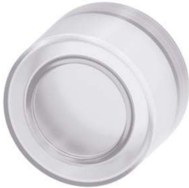
Silicone-free protective cover for pushbutton raised, 22 mm, clear