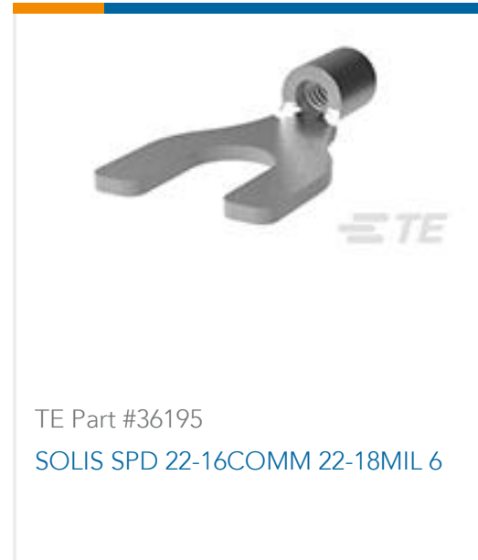
TE Part #36195 SOLIS SPD 22-16COMM 22-18MIL 6