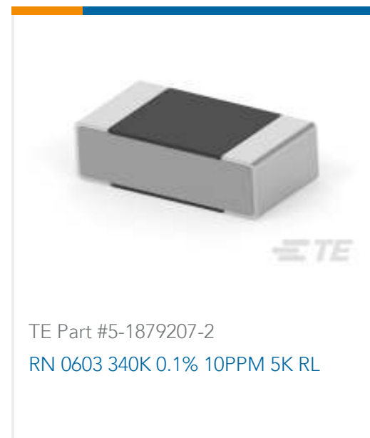
TE Part #5-1879207-2 RN 0603 340K 0.1% 10PPM 5K RL