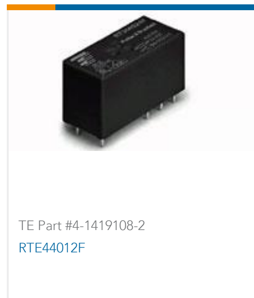
TE Part #4-1419108-2 RTE44012F