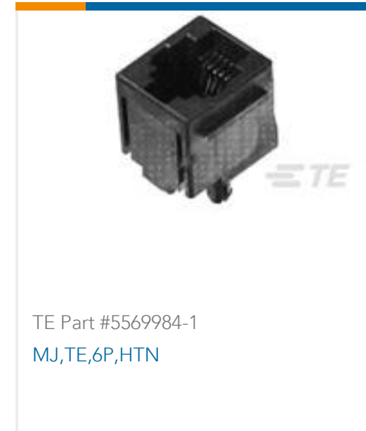
TE Part #5569984-1 MJ,TE,6P,HTN