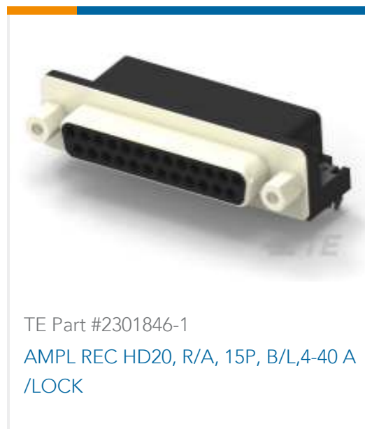
TE Part #2301846-1 AMPL REC HD20, R/A, 15P, B/L, 4-40 A /LOCK