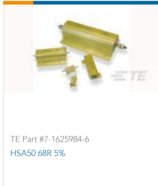
TE Part #7-1625984-6 HSA50 68R 5%