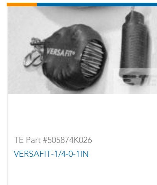
TE Part #505874K026 VERSAFIT-1/4-0-1IN