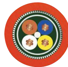
Sercos III [93K]