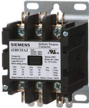
Contactor, 42DP,30A,3P,Open,277 Contactor, 42DP,30A,3P,Open,277