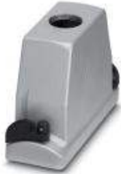
HEAVYCON ADVANCE EMV sleeve housing B24, with bayonet locking, height 100 mm, with 1x M40 thread, straight cable outlet

Please be informed that the data shown in this PDF Document is generated from our Online Catalog. Please find the complete data in the user's documentation. Our General Terms of Use for Downloads are valid ( http://download.phoenixcontact.com )