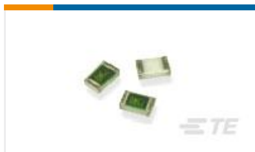
TE Part #1676172-2 RN 0805 12K1 0.1% 10PPM 1KRL