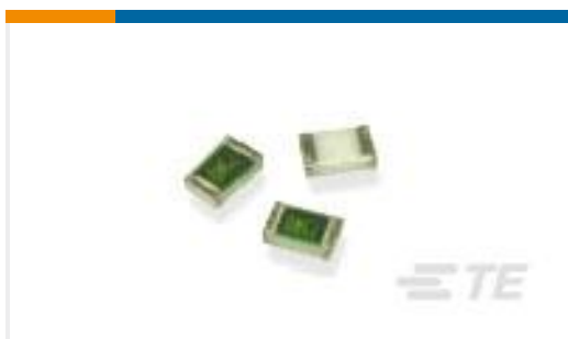
TE Part #8-1625868-5 RP 2A 0.25W 40R2 0.1% 25PPM 1K RL