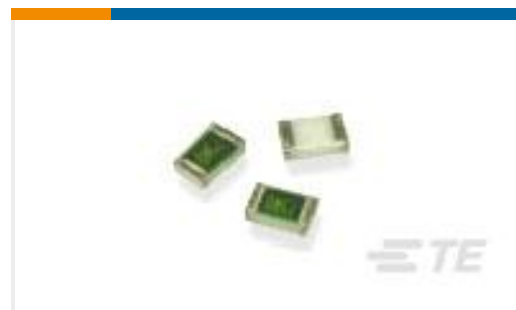
TE Part #1676203-2 RN 0805 16K2 0.1% 10PPM 1KRL