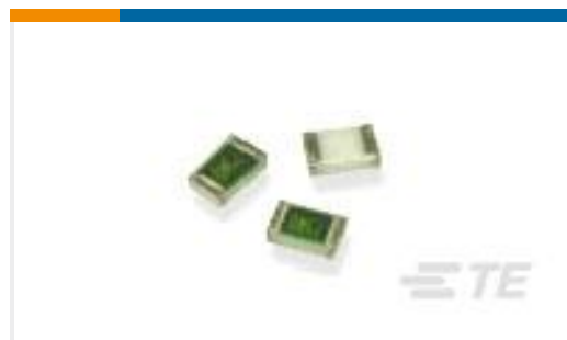
TE Part #1676199-2 RN 0805 15K 0.1% 10PPM 1KRL