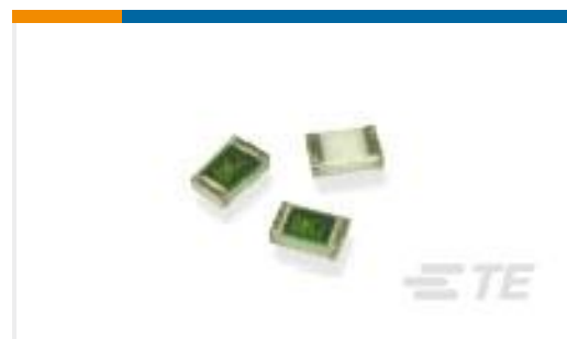
TE Part #1-2176093-4 RP 2A 0.25W 12K7 0.1% 25PPM 1K RL