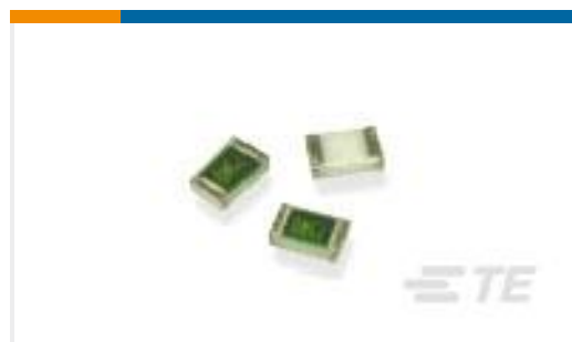
TE Part #1676426-2 RN 0805 750R 0.1% 10PPM 1KRL