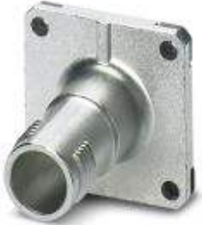
Flange housing, 25 mm x 25 mm

Please be informed that the data shown in this PDF Document is generated from our Online Catalog. Please find the complete data in the user's documentation. Our General Terms of Use for Downloads are valid ( http://download.phoenixcontact.com )