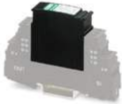
Surge protection plug for base element, for the protection of a double wire of the Uko interface (ISDN).

Please be informed that the data shown in this PDF Document is generated from our Online Catalog. Please find the complete data in the user's documentation. Our General Terms of Use for Downloads are valid ( http://phoenixcontact.com/download )