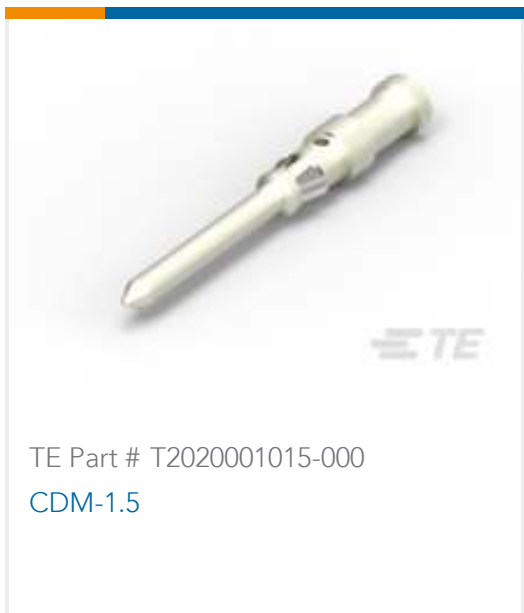
TE Part # T2020001015-000 CDM-1.5