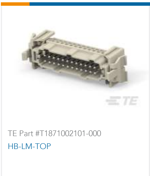
TE Part #T1871002101-000 HB-LM-TOP