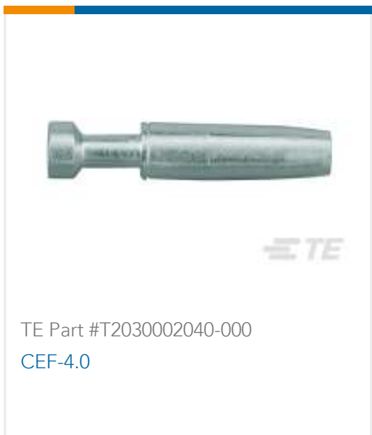
TE Part #T2030002040-000 CEF-4.0