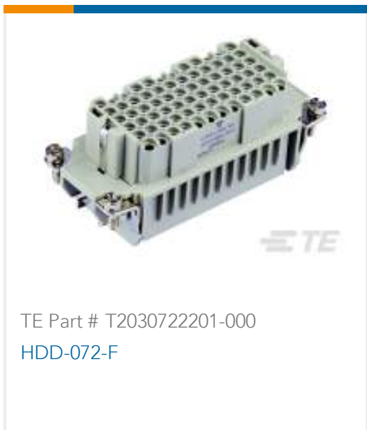
TE Part # T2030722201-000 HDD-072-F