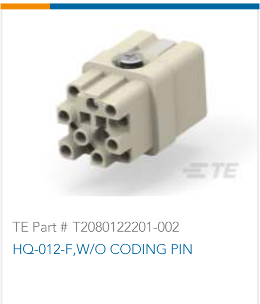
TE Part # T2080122201-002 HQ-012-F,W/O CODING PIN