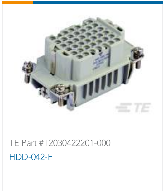
TE Part #T2030422201-000 HDD-042-F