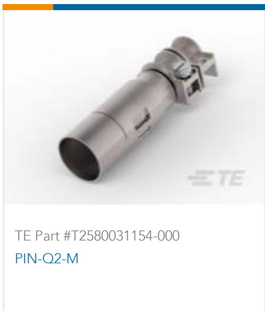
TE Part #T2580031154-000 PIN-Q2-M