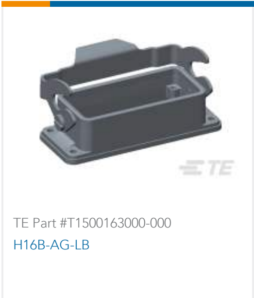
TE Part #T1500163000-000 H16B-AG-LB