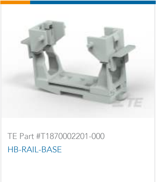
TE Part #T1870002201-000 HB-RAIL-BASE