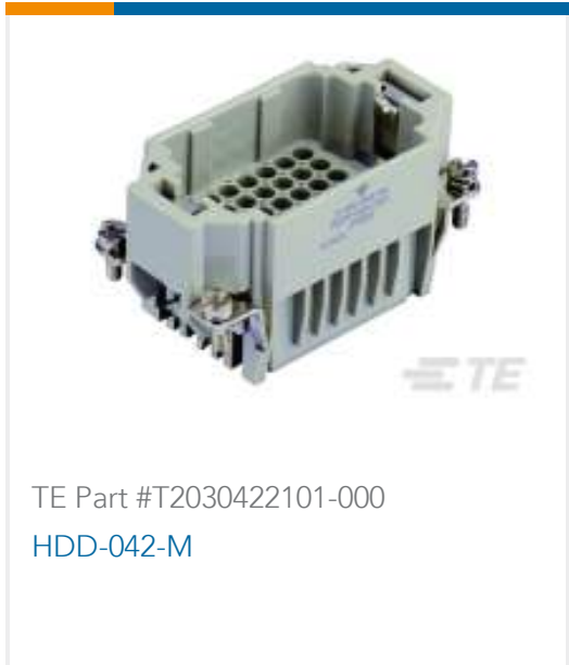
TE Part #T2030422101-000 HDD-042-M