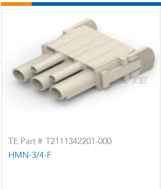
TE Part # T2111342201-000 HMN-3/4-F