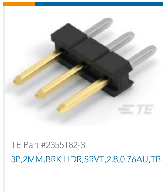
TE Part #2355182-3 3P,2MM,BRK HDR,SRVT,2.8,0.76AU,TB