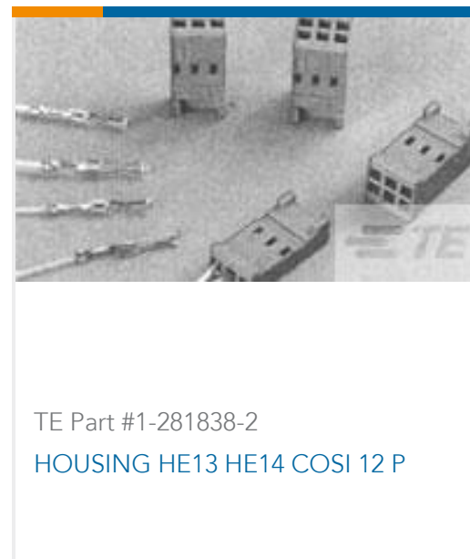
TE Part #1-281838-2 HOUSING HE13 HE14 COSI 12 P