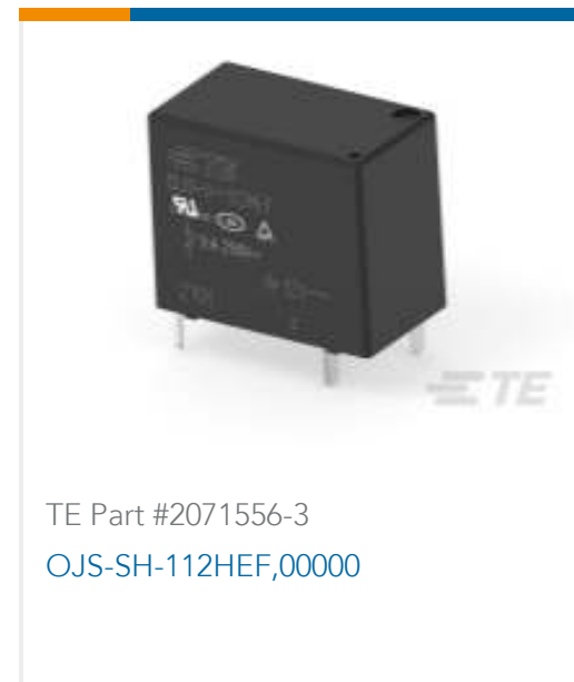
TE Part #2071556-3 OJS-SH-112HEF,00000