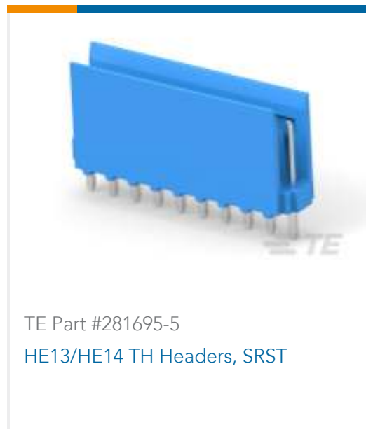
TE Part #281695-5 HE13/HE14 TH Headers, SRST