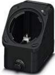
HEAVYCON EVO sleeve housing, plastic, with bayonet flange for EVO screw connection, B10, for single locking latch, height: 60.5 mm, without EVO screw connection

Please be informed that the data shown in this PDF Document is generated from our Online Catalog. Please find the complete data in the user's documentation. Our General Terms of Use for Downloads are valid ( http://download.phoenixcontact.com )