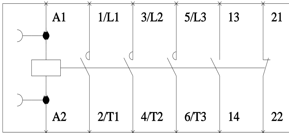
LENO0C003 Wiring Diagram