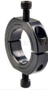
*Additional hardware #01 included