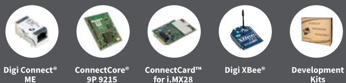
Digi Connect® ME