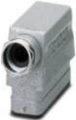
The illustration shows version HC-D 25-TFL-72/M 1 PG 16 S

Sleeve housing, for single locking latch, height 58 mm, without screw connection, 1x Pg16, lateral cable entry