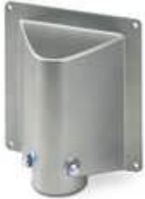
Adapter for mounting on 48 mm standard tube

Please be informed that the data shown in this PDF Document is generated from our Online Catalog. Please find the complete data in the user's documentation. Our General Terms of Use for Downloads are valid ( http://phoenixcontact.com/download )