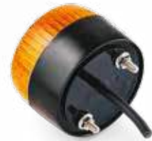
Sealed cable insulation/entry