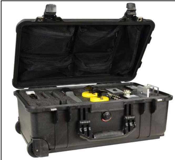
Figure 1. Desco 19790 ESD Survey Kit