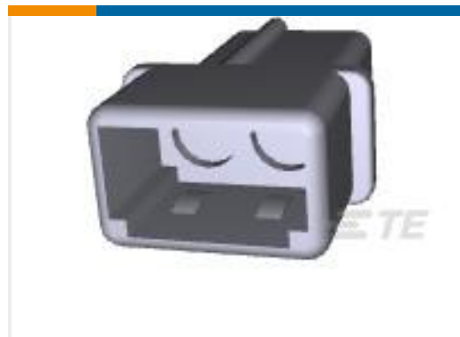
TE Part #1-480319-0 02P CMNL CAP HSG NATL