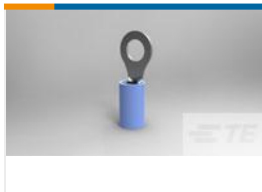
TE Part #36160 TERMINAL,PIDG R 16-14 10