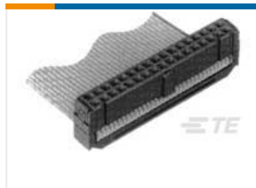
TE Part #1658622-2 14 NOVO MIL/CTR 30DP,LEAD FREE