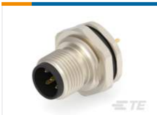
TE Part #T4140012051-000 M12,REAR MOUNTING,MALE,A CODE,5P