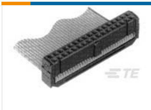
TE Part #1658622-9 40 NOVO MIL/CTR 30DP,LEAD FREE