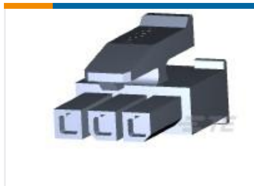
TE Part #1445022-3 MICRO MNL RFECEPT HSG SINGLE R