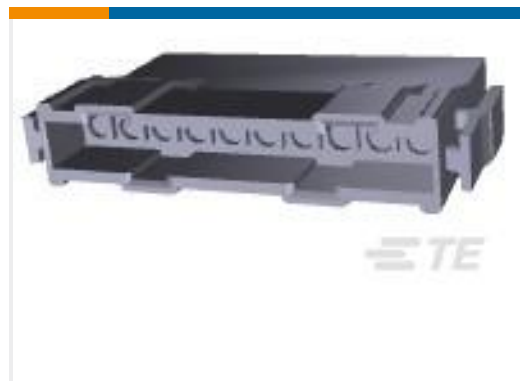
TE Part #207397-1 HSG,RECEPT 10 POSN,METRIMATE