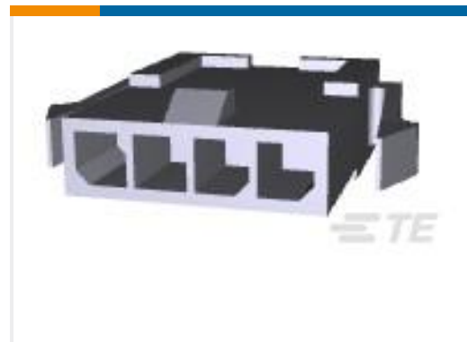
TE Part #1445048-4 PANEL MT SNGL ROW HSG 4 POS