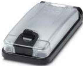
Mounting frame for one front plate/socket, frame: black, cover: transparent, closed with rotary knob.

Please be informed that the data shown in this PDF Document is generated from our Online Catalog. Please find the complete data in the user's documentation. Our General Terms of Use for Downloads are valid ( http://phoenixcontact.com/download )