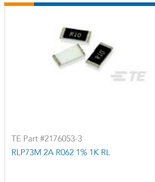
TE Part #2176053-3 RLP73M 2A R062 1% 1K RL