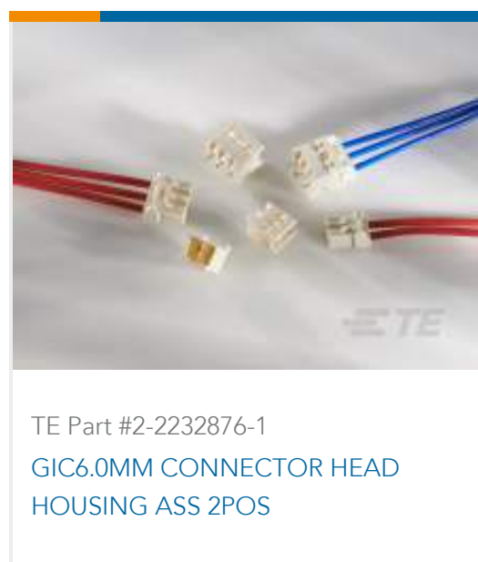
TE Part #2-2232876-1 GIC6.0MM CONNECTOR HEAD HOUSING ASS 2POS