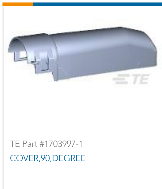
TE Part #1703997-1 COVER,90,DEGREE