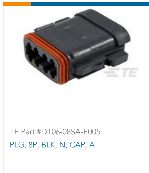
TE Part #DT06-08SA-E005 PLG, 8P, BLK, N, CAP, A