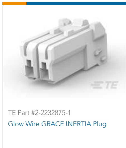
TE Part #2-2232875-1 Glow Wire GRACE INERTIA Plug