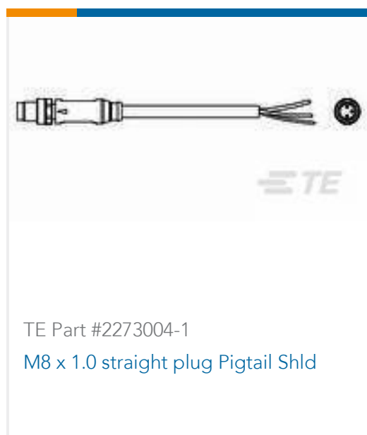
TE Part #2273004-1 M8 x 1.0 straight plug Pigtail Shld