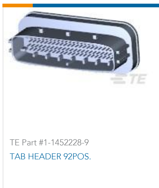
TE Part #1-1452228-9 TAB HEADER 92POS.