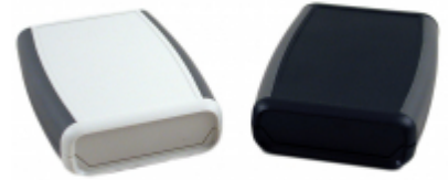
Light Grey or Black Enclosure Color