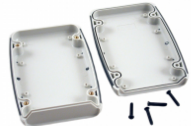
Key Internal Features