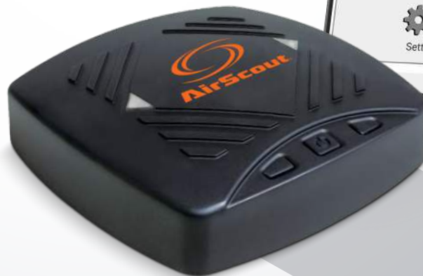
- Test List