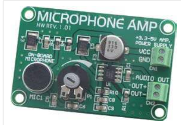
Figure 1: MICROPHONE AMP additional board