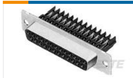
TE Part #1-745491-6 09 HDE MS RCPT, 26-30, LEAD FREE