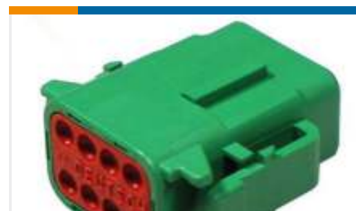
TE Part #DTM06-08SC PLG, 8P, GRN, N, C