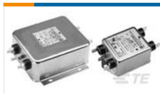
TE Part #6609042-1 3VS1=F7246 S0