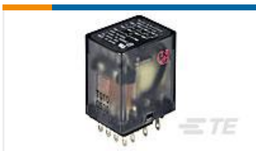
TE Part #4-1393122-3 KHAU-17D11-12=KH