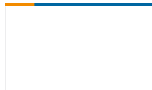
TE Part #RE04-106P PLUG ASSY