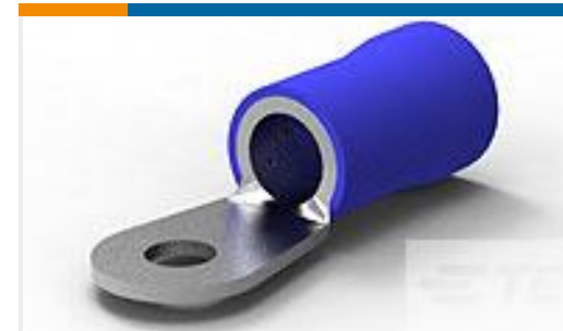
TE Part #52045-1 TERMINAL R PG 1/0 5/16