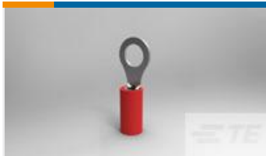
TE Part #320552 PIDG R 22-16 COMM 22-18 MIL 10