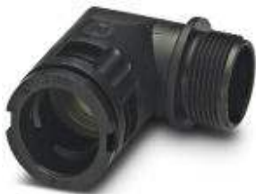
Cable gland, metric thread, IP68/69k protection, angled

Please be informed that the data shown in this PDF Document is generated from our Online Catalog. Please find the complete data in the user's documentation. Our General Terms of Use for Downloads are valid ( http://phoenixcontact.com/download )