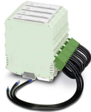
Figure shows variant for 4 modules

http://eshop.phoenixcontact.de/phoenix/treeViewClick.do?UID=2900746